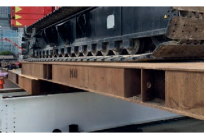
Spreading the Load from Outriggers